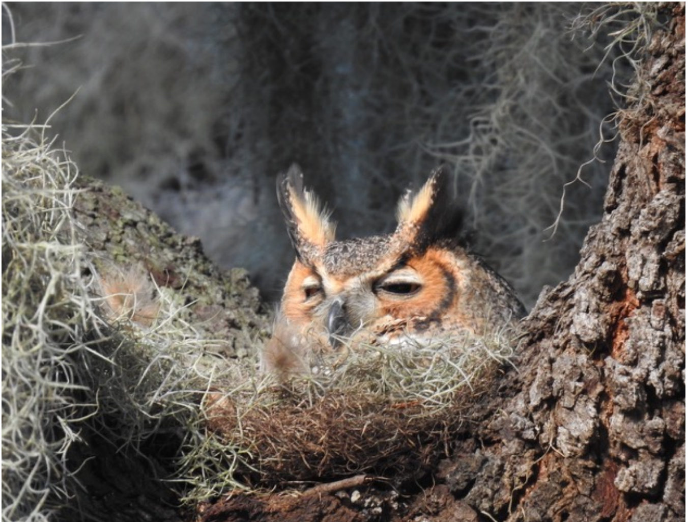
Mama Great Horned Owl in nest

Blue Jay 2 American Crow 12 Fish Crow 6 crow sp. 20 Tufted Titmouse 3 Ruby-crowned Kinglet 3 Blue-gray Gnatcatcher 2 Northern Mockingbird 1 Eastern Bluebird 1 Red-winged Blackbird 1 Boat-tailed Grackle 3 Black-and-white Warbler 1 Palm Warbler 7 Yellow-rumped Warbler 4 Yellow-throated Warbler 1 Northern Cardinal 3