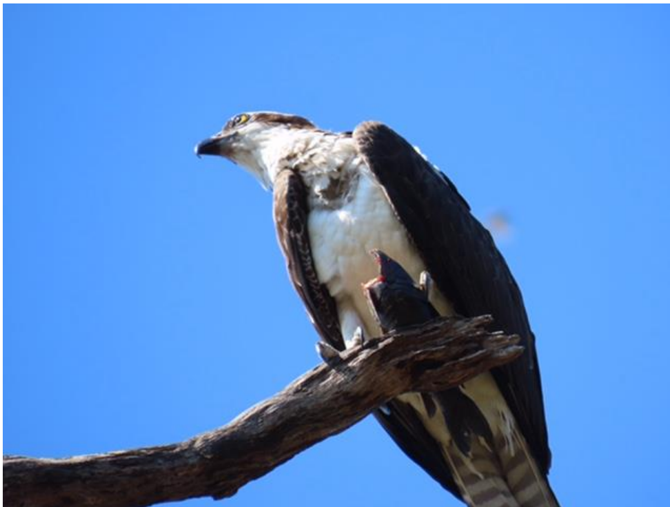
Osprey with “lunch”