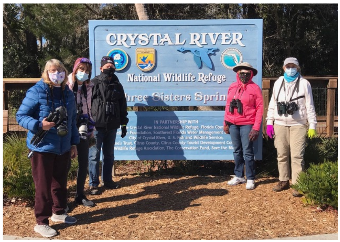
A couple of Manatee shots along with an adorable Marsh Rabbit that has very small ears for a rabbit: