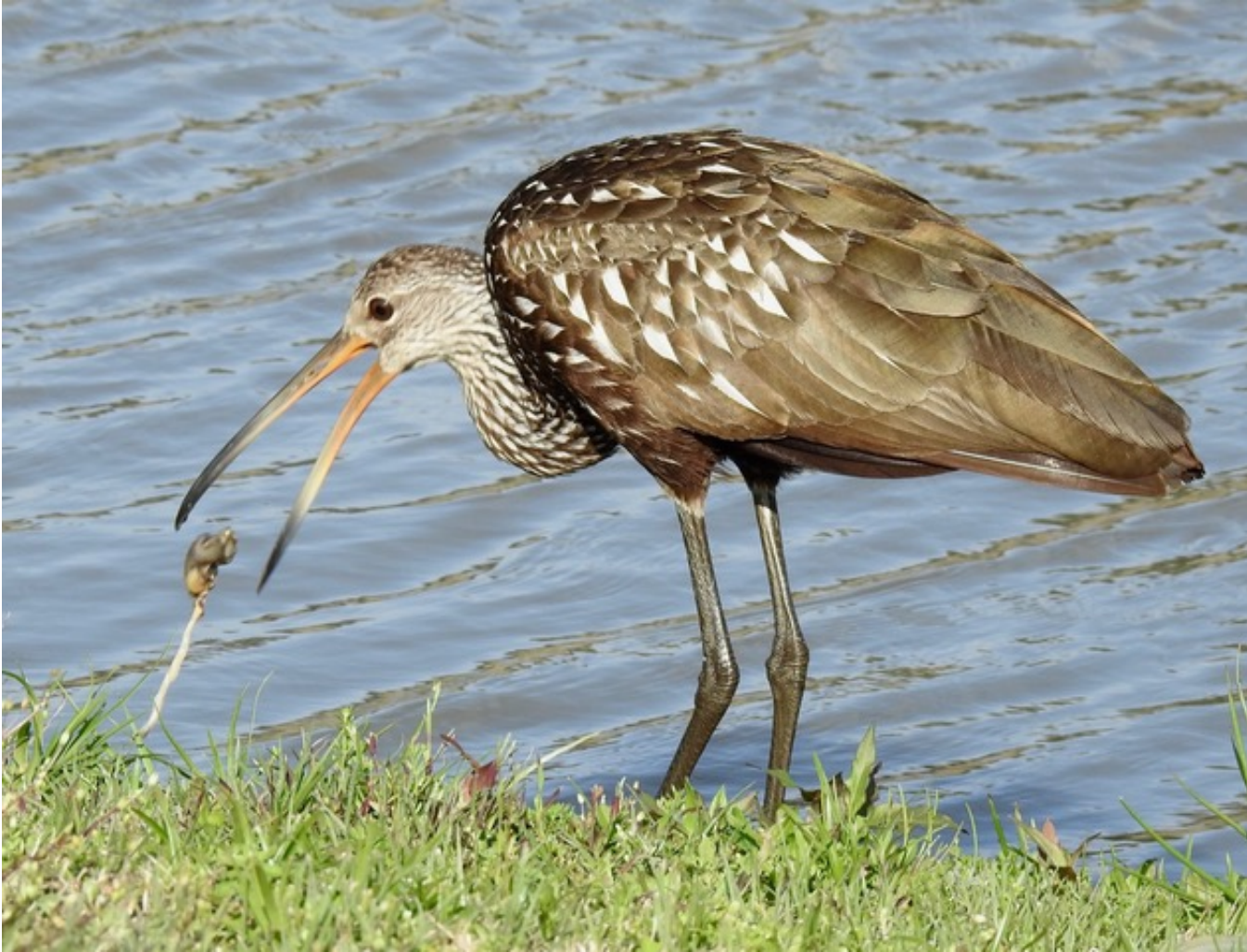
Limpkin with Snail/Clam