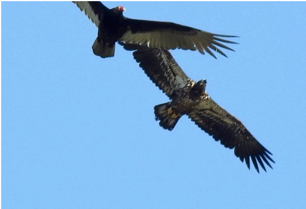
Turkey Vulture on left flying with immature Bald Eagle on right