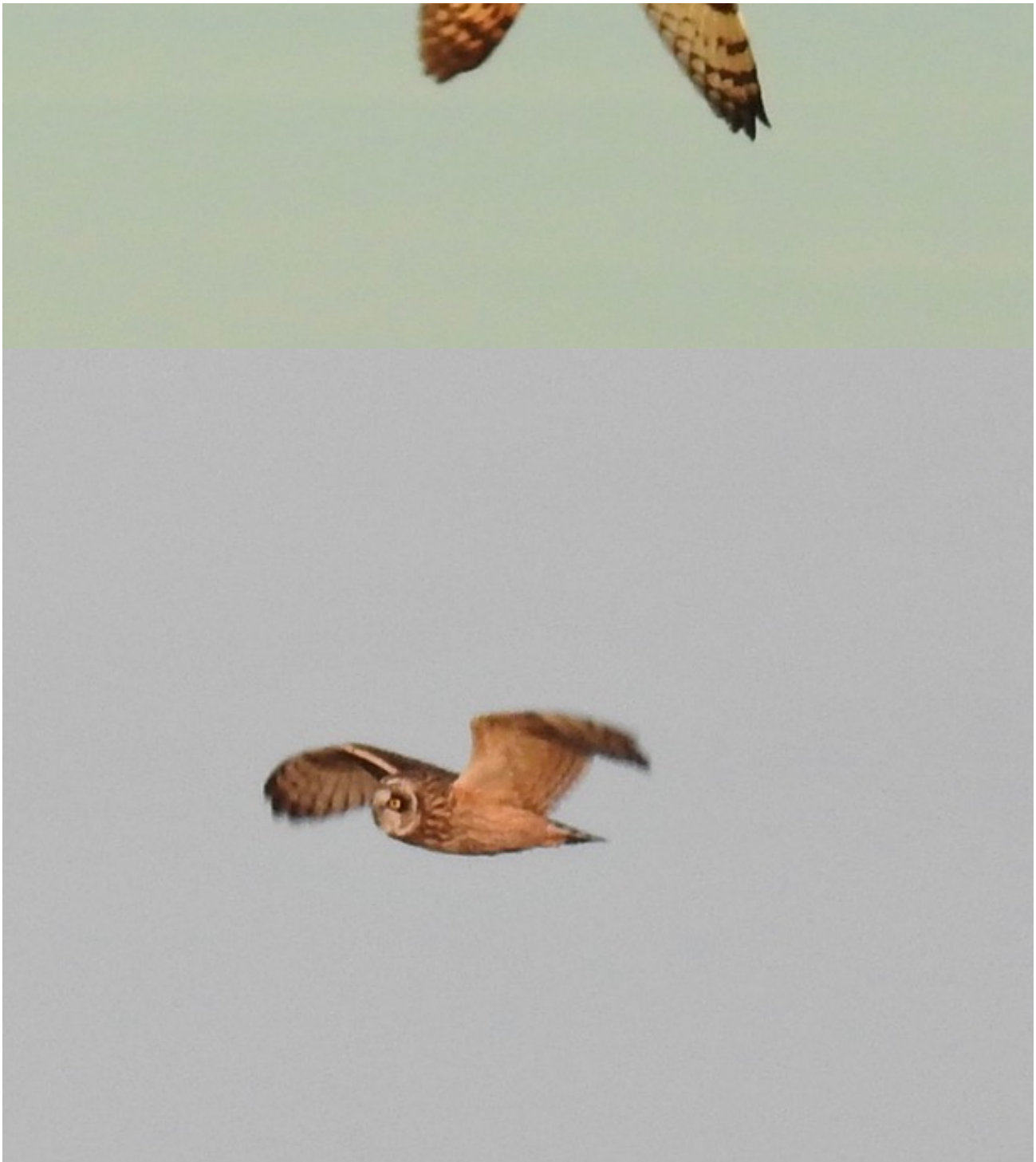
Short-eared Owl: photo by Alice Horst