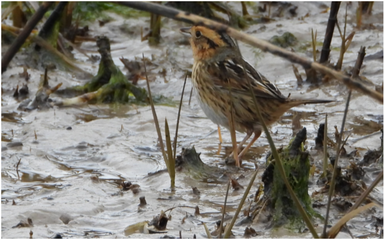
Nelson's Sparrow