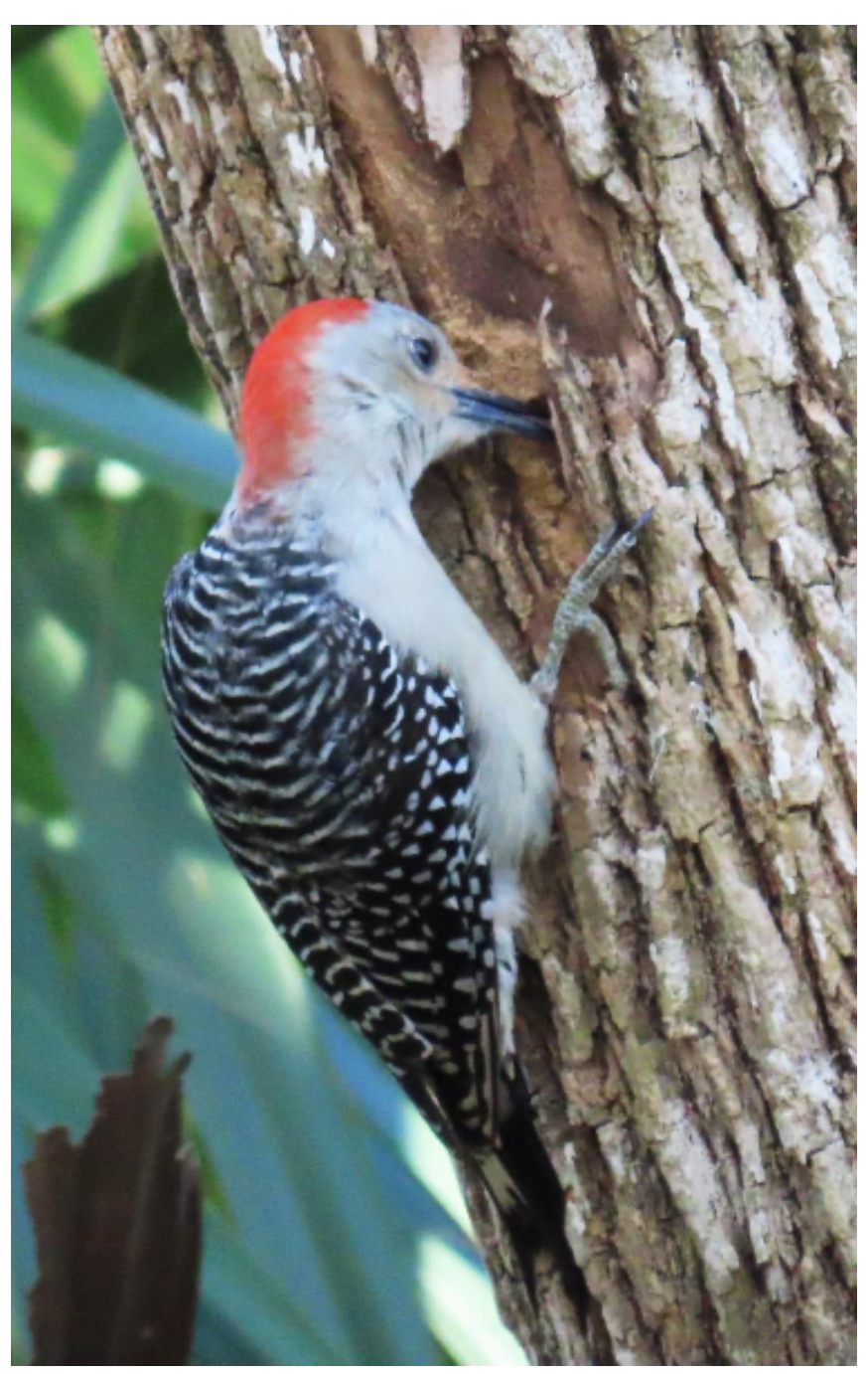
Red-bellied Woodpecker - I see you in there!!