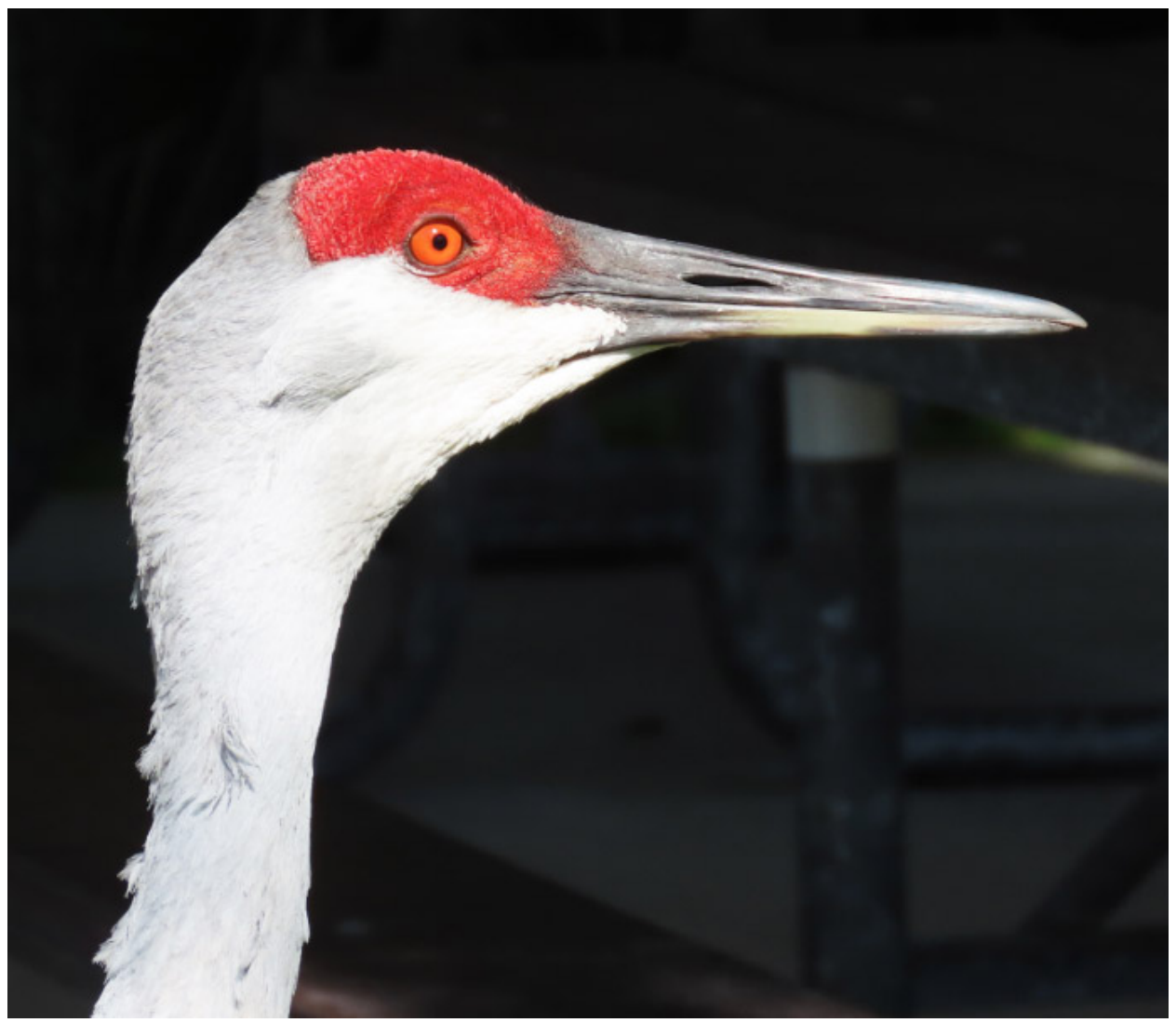
Sandhill Crane - this guy or gal was purring like a cat - looked it up, they make soft purrs to communicate with their family...two-part purr before flight...a slow purr while they are feeding.