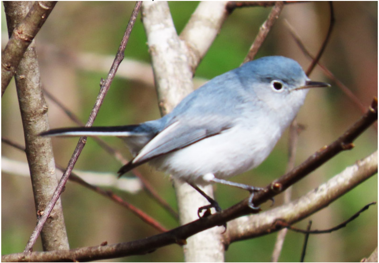
Blue-gray Gnatcatcher - these little guys are really hard to photograph - they are never are still

"Tastes like chicken!" One lucky Florida Red-bellied Cooter