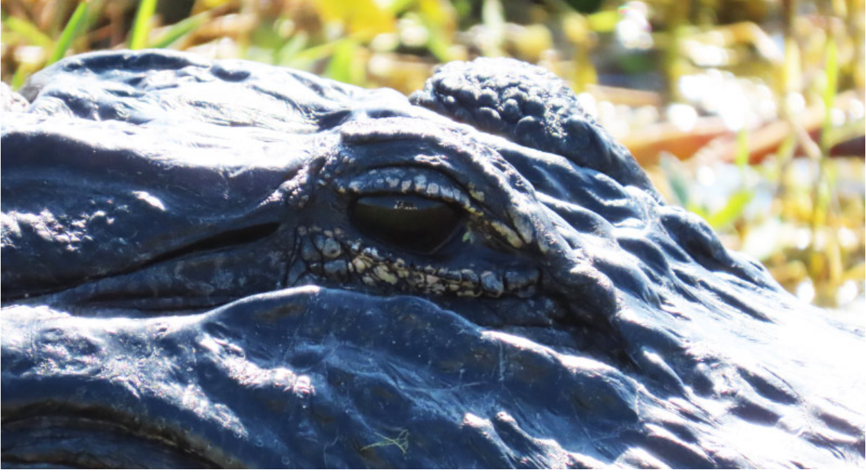
I think I see my reflection in his eye - YIKES!