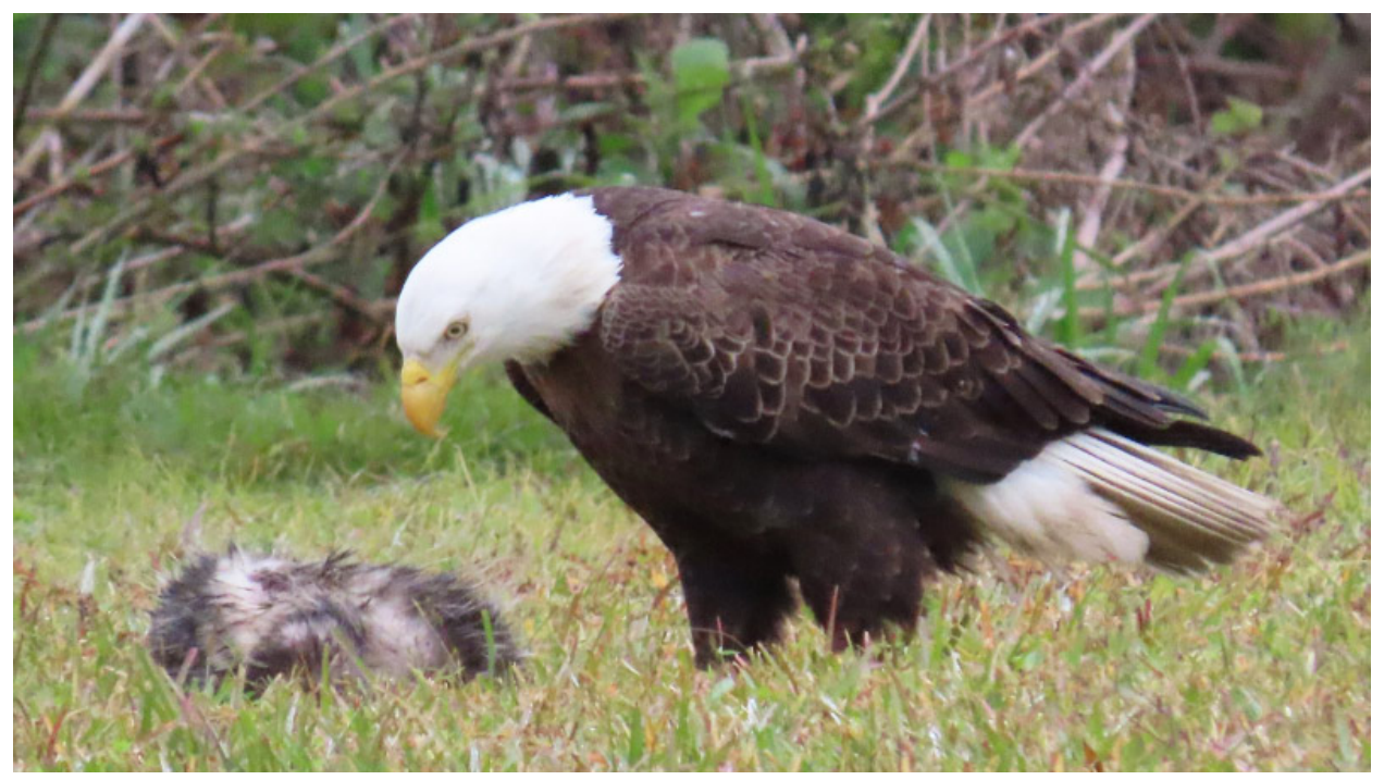
Bald Eagle - What the heck is this!