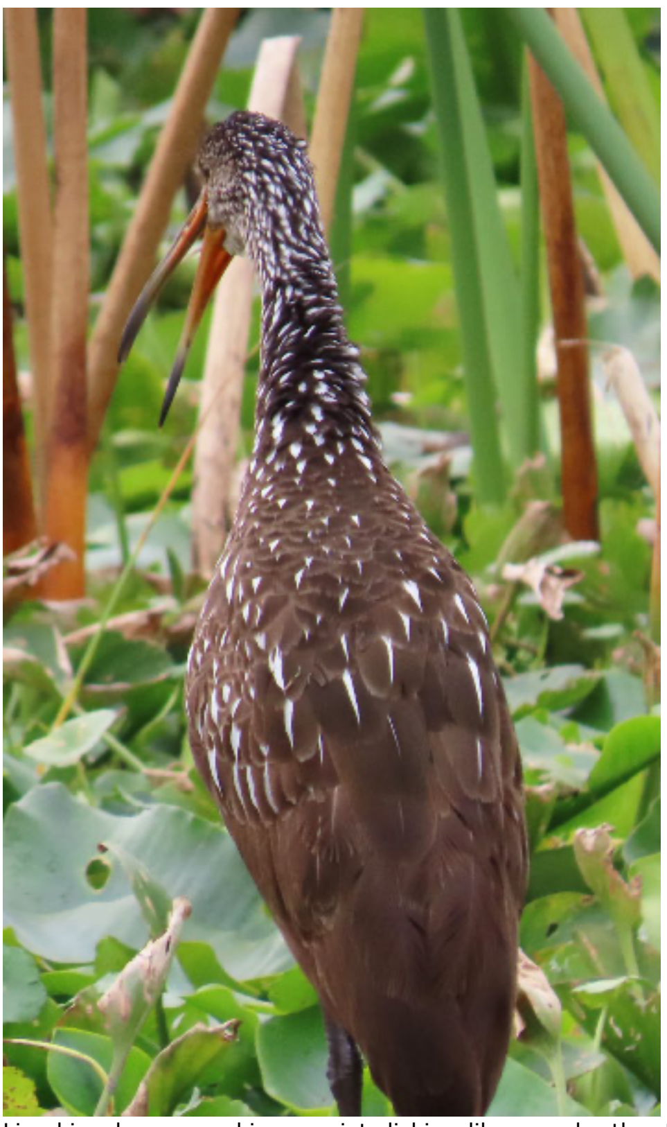
Limpkin - he was making a quiet clicking-like sound rather than his typical loud, haunting sound.