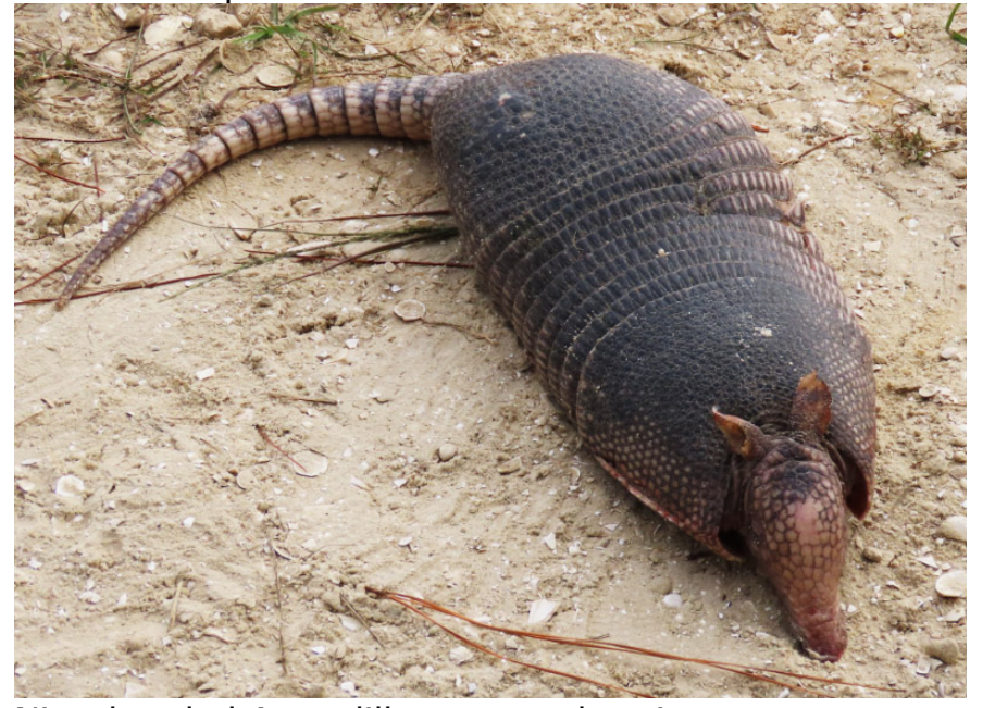
Nine-banded Armadillo - count them!