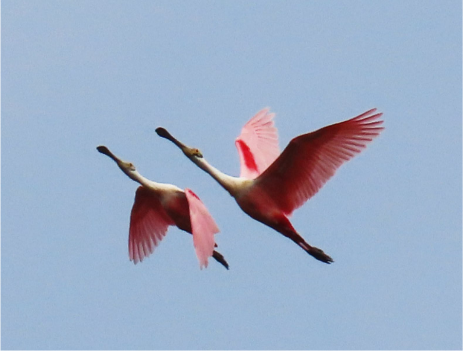
Not a good photo - but it was beautiful to watch this "dance."