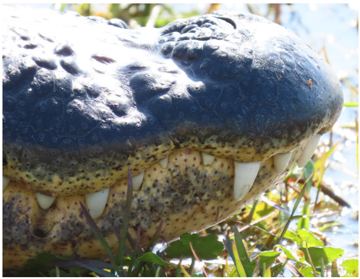
As Little Red Riding Hood would say - "My, what big teeth you have!"