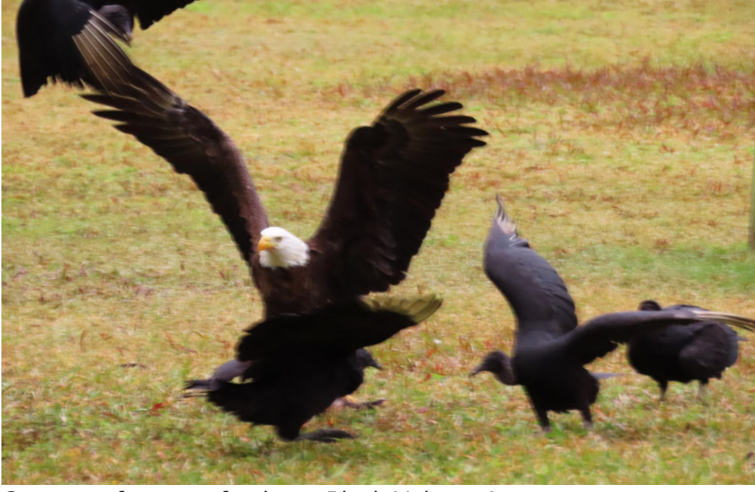
Get away from my food you Black Vultures!