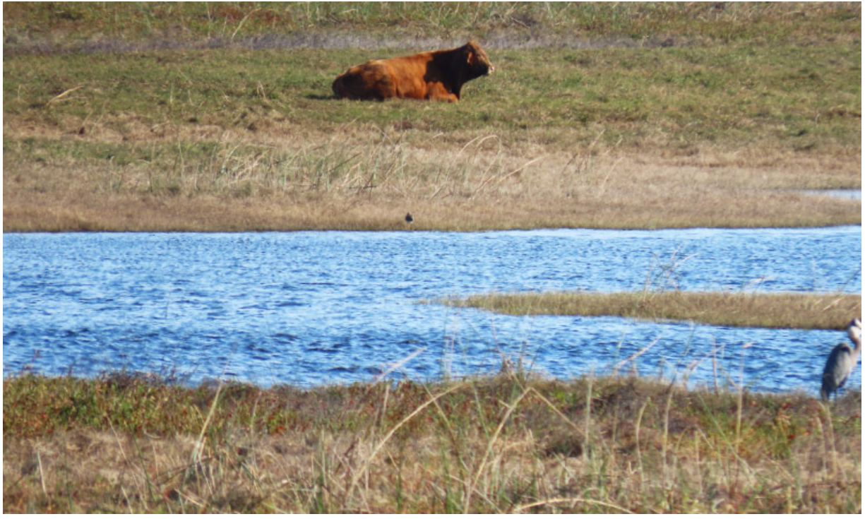
The brown cow - you had to be with us to appreciate this