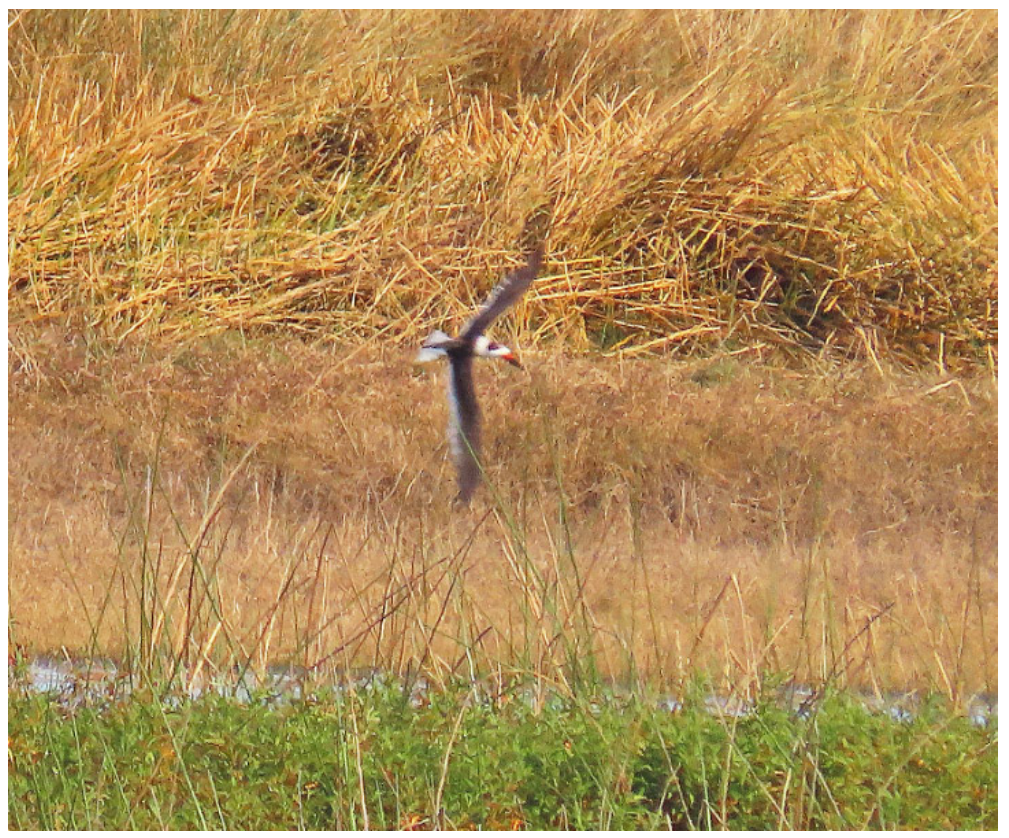
Black Skimmer - not a good photo. We were surprised to see one here; however, I looked it up - we were only 18 miles from the East Coast.