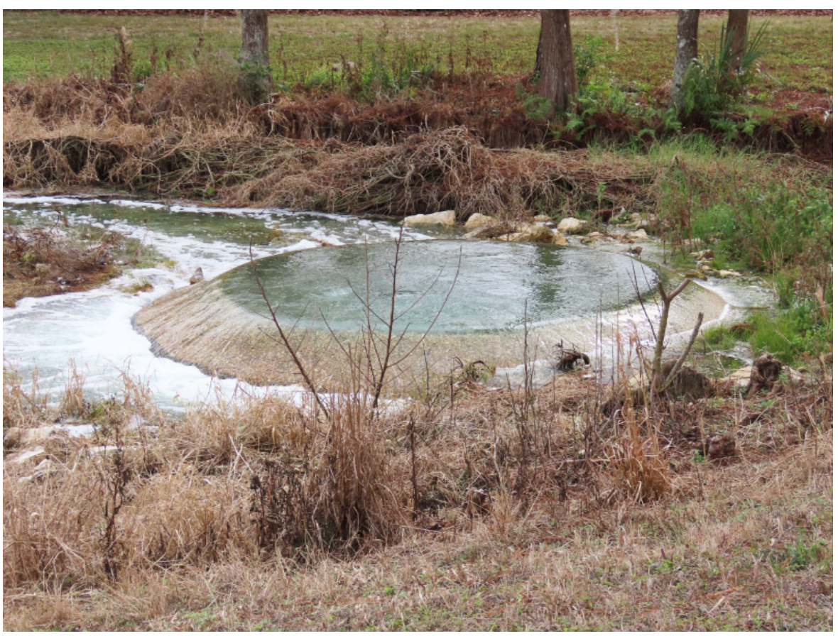
They've caught people in this incoming water - if they only knew what was in it - YUK!