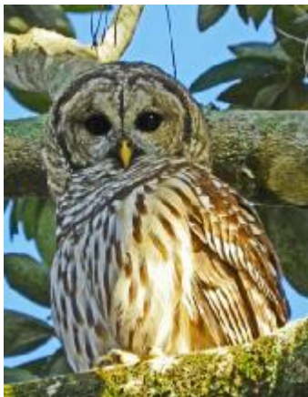
Barred Owl at Mead Garden

"In Hernando County on Kettering Road we searched for Burrowing Owls. We saw many Meadowlarks, Kestrels and other raptors, but no Owls. At Linda Pederson Park we saw Manatees and at Brooksville Cemetery we saw Yellow-throated Warblers and Northern Parulas. On the way home we encountered 25 Swallow-tail Kites on CR 229 off of CR 466, just above us. WOW, is that something!